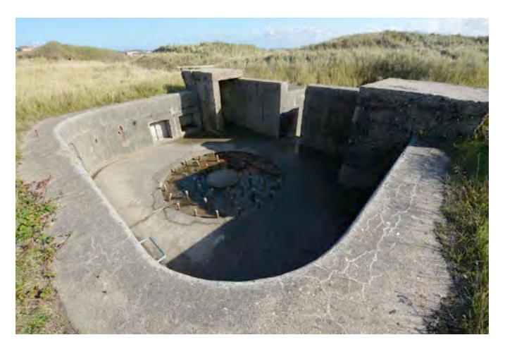
Fig. 5: Photograph of a remaining artillery position