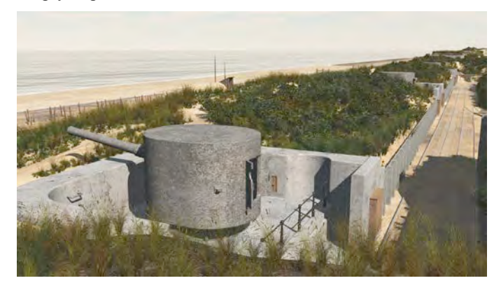
Fig. 4: Detail of the 3D reconstruction of Battery Aachen

In any case, the interpretation of all sources and the formulation of hypotheses that fitted with the terrain and the expert knowledge benefitted heavily from the 3D aspect. Doing the same job in 2D on maps and aerial photographs is simply impossible.