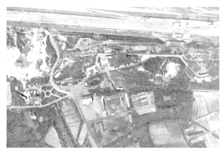
Fig. 2: Aerial view of Battery Aachen in April 1918

The second step is analysing and correlating the images, the building remains and the other sources. Together with the experts of the museum and the Province, we discussed every photo and text available. Of course, not everything was immediately clear and therefore drawings and 3D helped to interpret the sources in an iterative way. In a few cases, an external specialist on WWI was needed to provide information and help with the interpretation. After more than 10 meetings we came to a 'final' virtual reconstruction of Battery Aachen in 1915 and 1917.