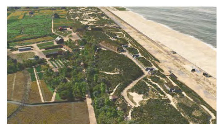
Fig. 3: 3D landscape reconstruction of Battery Aachen

Defining the vegetation was also done through brushing. These vegetation maps were loaded into the landscape software (E-on Vue) that creates highly realistic 3D vegetated landscapes with animation, fractal ground textures, water animation and sky with cloud animations. In this software we define for each terrain type the plants, their position and distribution. When the landscape is fully defined, the vegetation is populated in a procedural way all over the terrain.